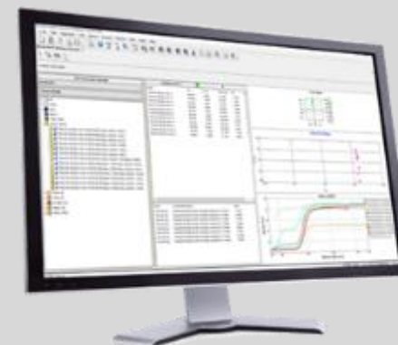
Quality Control & Quality Assurance Software