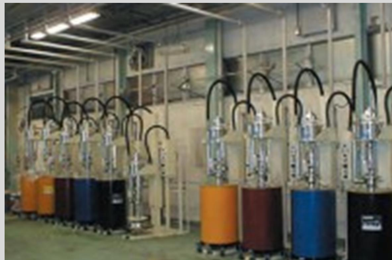
Printing INK Supply Pumps