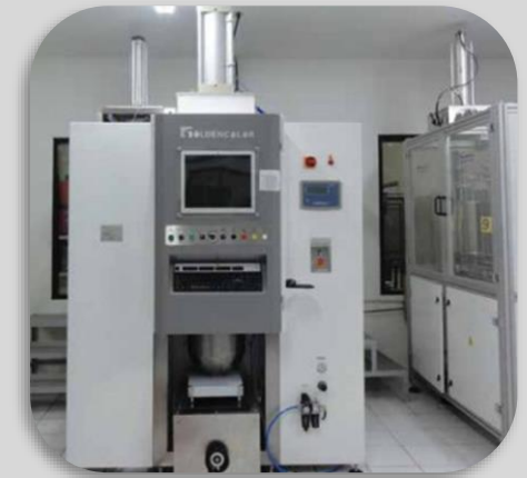
Automatic UV ink dispensing system