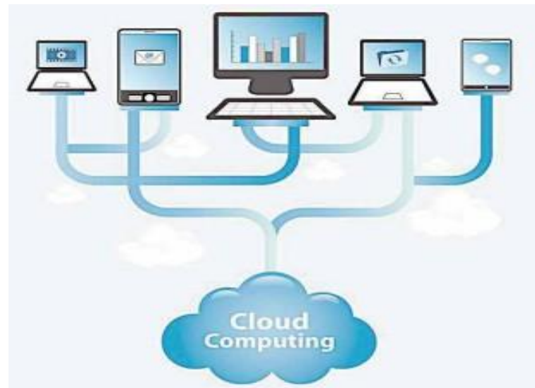
The cloud services system