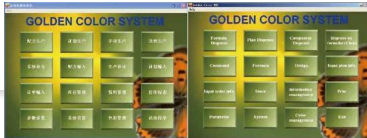
Golden Color Dispensing software