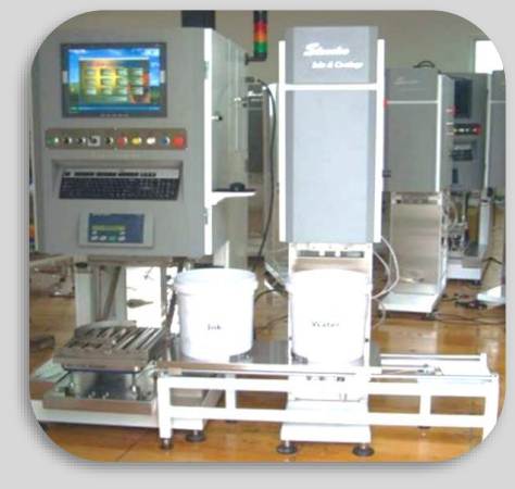
Automatic water based ink dispensing system