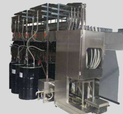
Automatic solvent based ink dispensing system