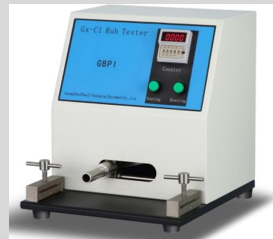
Gx-C1 Ink Abrasion Resistant