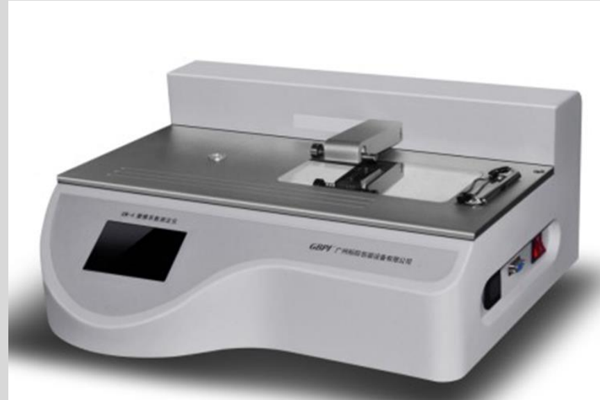
GM-4 Coefficient of Friction Tester

GBPI was established in 2002 and is located in Guanzhou Economic Development Zone. It is an enterprise integrating R&D, production, and sales of packaging instruments, packaging equipments, and provides third-party testing and standard material capability.