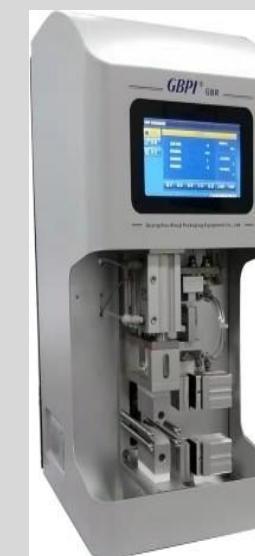
GBR Hot Track Tester