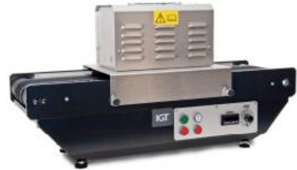
IGT UV Dryer