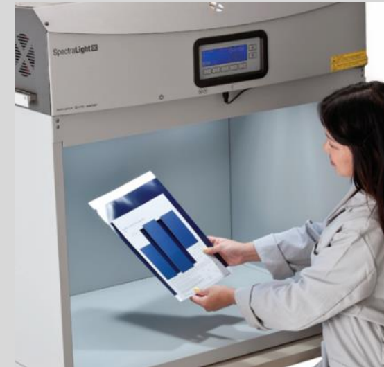
X-rite lightning solutions

We have a long history with X-rite and have successfully maintained more than twenty-year of commitment with our principal and our customers.