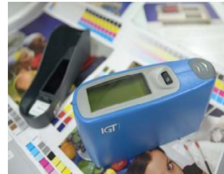
IGT Gloss Meter G60 – G75T