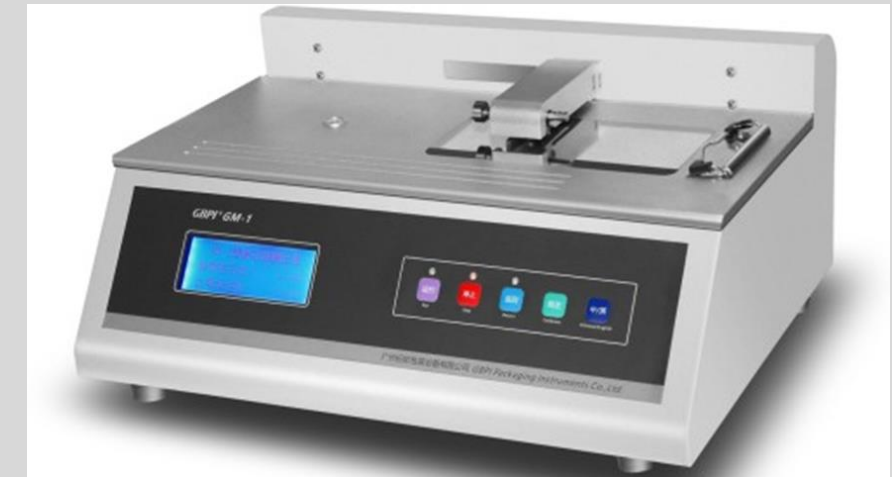
GM-1 Coefficient of Friction Tester