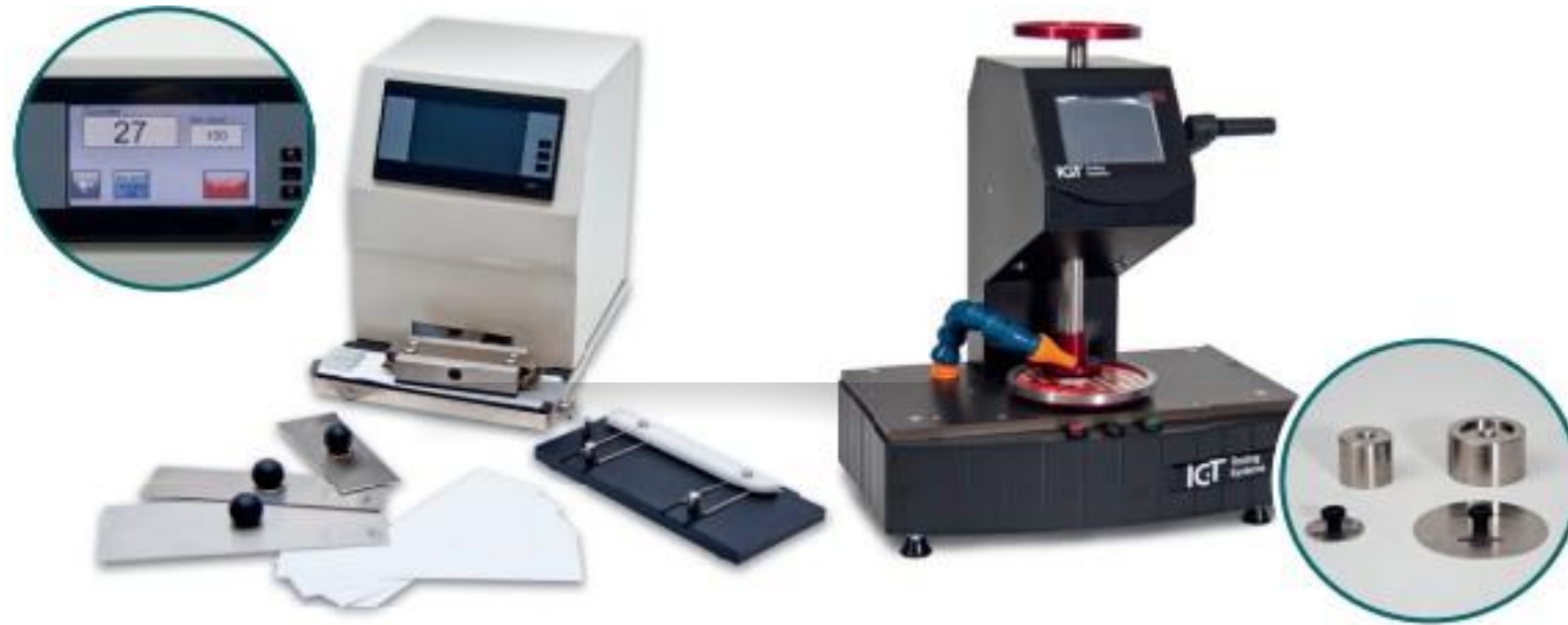
Sutherland type Ink Rub Tester